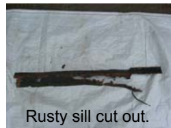
Rusty sill cut out.

The small boss that connected to the indicator stalk had broken off. A second hand wheel from an auto jumble was fitted in the straight-ahead position and the drag link adjusted to suit. The steering now turned from lock to lock and came up against the lock stops with the road wheels just clear of the suspension arms.